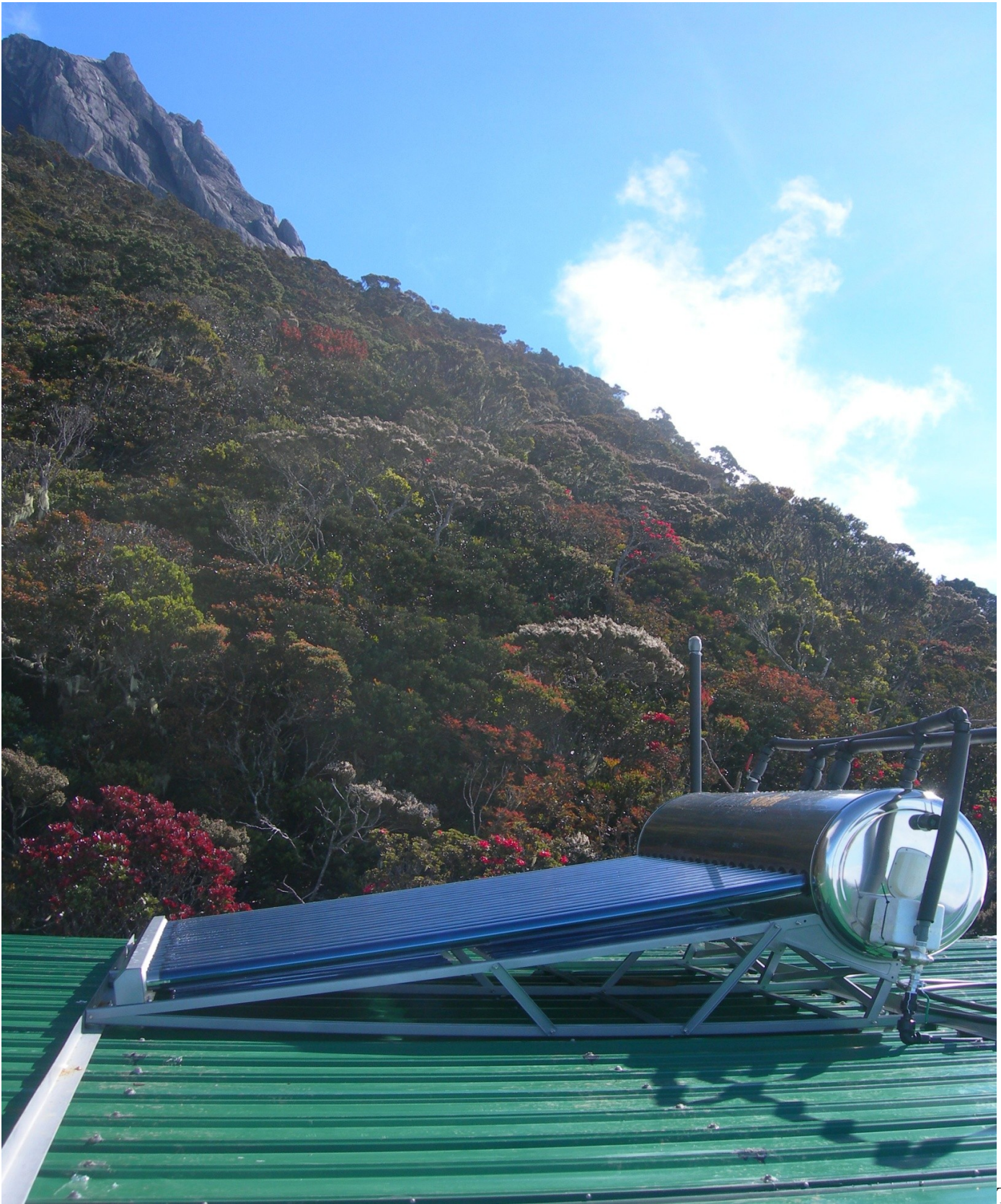
The completed Microsolar installation at 3300m elevation with sunny weather in between the clouds. One of the Donkey Ear's Peak 3965m of Mount Kinabalu above the Microsolar.