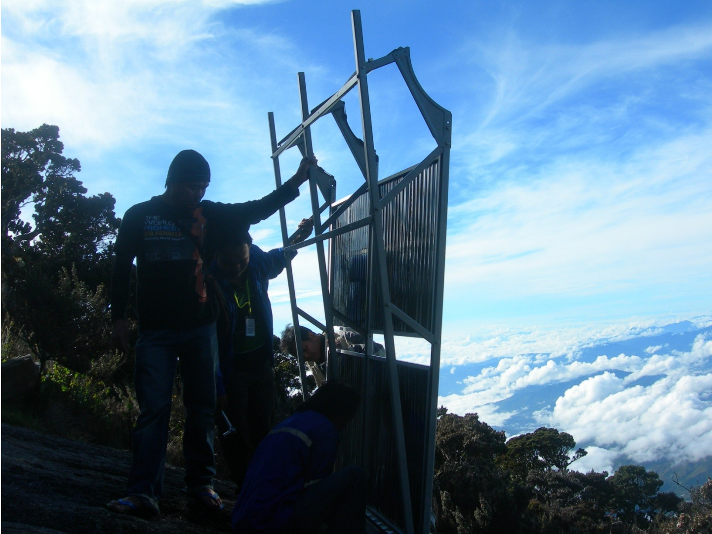
DSCN 6823 Assembling the frame